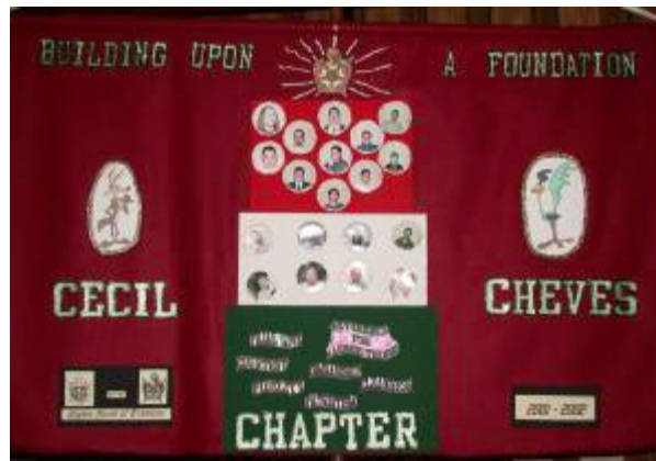
Cecil Cheves Chapter Third Place