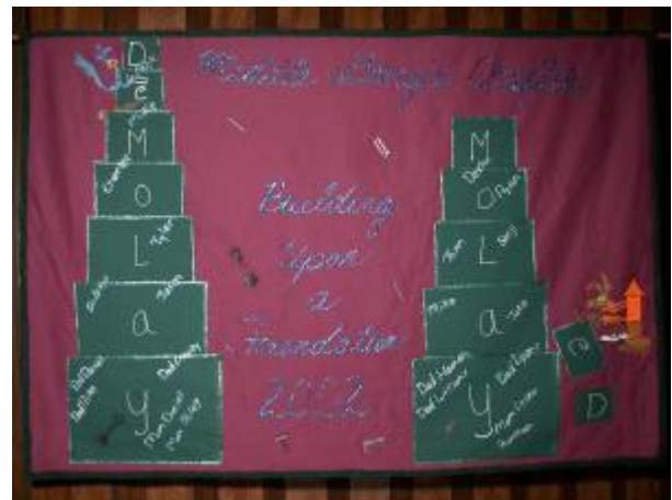
Middle Georgia Chapter