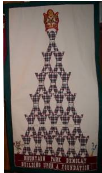
Mountain Park Chapter Second Place